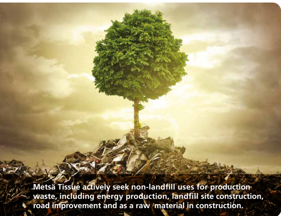
Metsä Tissue actively seek non-landfill uses for production waste, including energy production, landfill site construction, road improvement and as a raw material in construction.